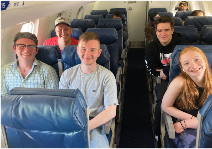
(above) SUNY Broome students on the plane headed to the Civil War Conference (below) and standing together at the Syracuse Airport.