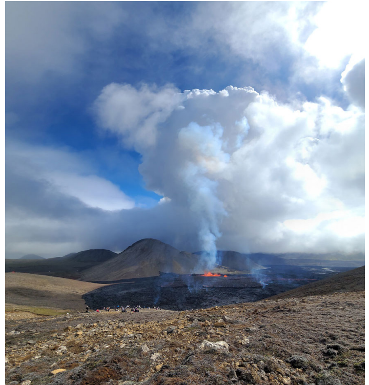
(above) The Fagradalsfjall volcano eruption with a pyrocumulus cloud forming from the volcanic gas and steam.

A fissure opened up in the Meradalir valley to the northeast of last year's eruption.