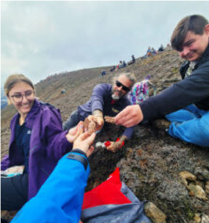
(above) SUNY Broome group toasting the eruption with the classic Icelandic candy bar, Hraun, which translates to lava.