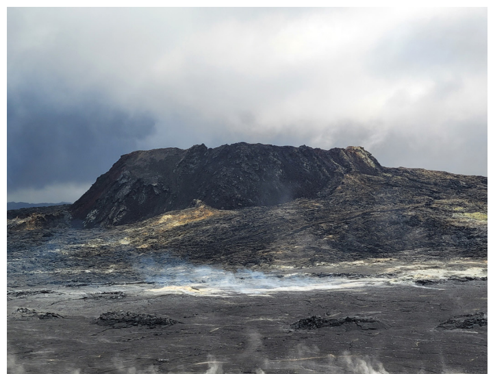
(below) The Fagradalsfjall volcano.

SUNY Broome plans to host a faculty-led travel program in Iceland in Summer 2023.